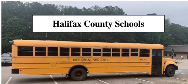
Halifax County Schools