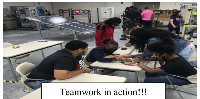
Teamwork in action!!!